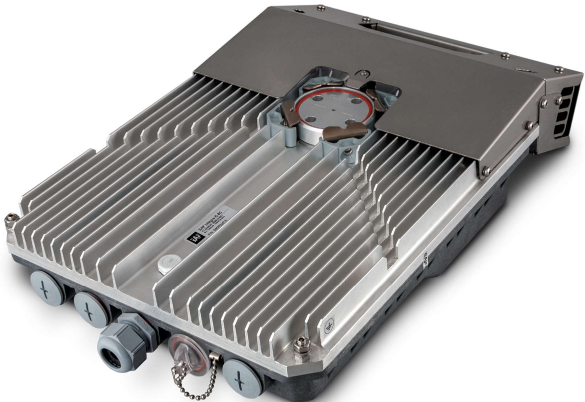
Pic 1. The exterior of Integra-E with antenna flange up

In most countries E-band radios are easy to deploy with no or minimal licensing requirements. Reducing time to deployment and reducing Total Cost of Ownership (TCO).