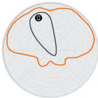
Figure 4. T750 2.4GHz Elevation Antenna Patterns