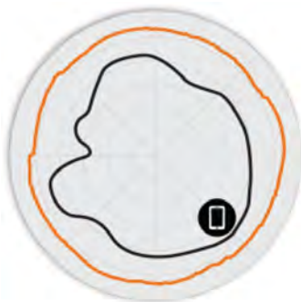
Figure 3. T750 5GHz Azimuth Antenna Patterns