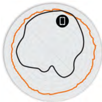
Figure 2. T750 2.4GHz Azimuth Antenna Patterns